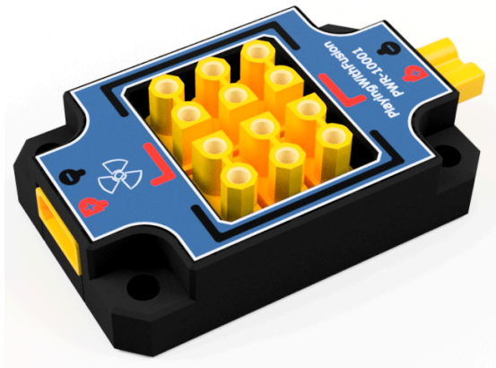
Figure 1: PWR-10001