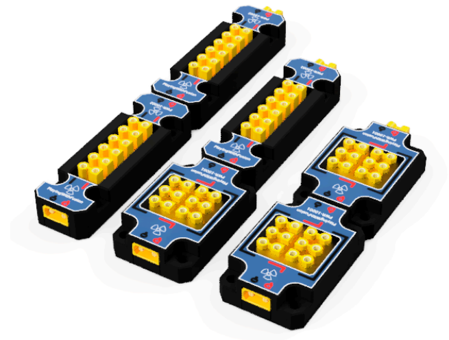
Figure 2: Daisy-chained modules

Power is an essential aspect of any electrical system. Playing With Fusion's XT30 power distribution board makes sharing that power easy. Built with a widespread connector, the XT30 is the ideal way to route power throughout your build. All aspects of the XT30 power distribution board were designed with users in mind. A mounting footprint of 1.75" by 0.625" reduces installation difficulty. The small footprint fits anywhere it is needed. With 6 output channels, the rats' nest of wires will disappear. If more channels are needed, multiple boards can be daisy-chained together (see Figure 2).