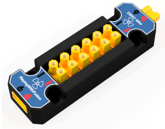
Figure 1: PWR-10002